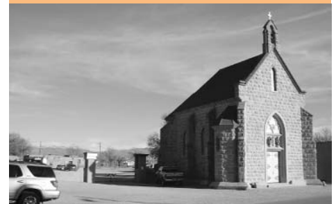
Our Lady of Lourdes continues to be a focal point of the community, and is a contributing resource to the San Juan Pueblo Historic District est. 1974. In 2005, the pueblo voted to restore its traditional name of Ohkay Owingeh.