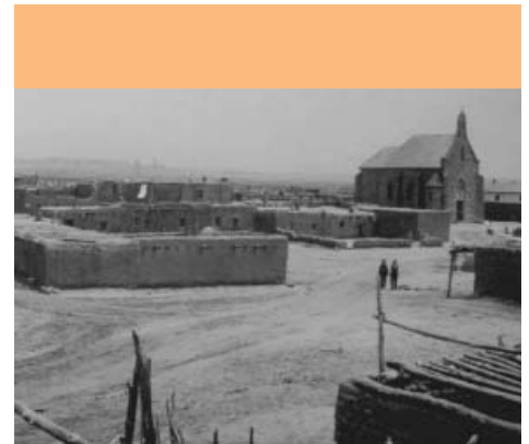
Our Lady of Lourdes chapel was built by a French priest in the center of the pueblo at the site of a church built by the Spanish when they proclaimed San Juan the first northern capital of New Spain in 1598. The Spanish church was destroyed in the Pueblo Revolt of 1680.

An unanticipated benefit followed the students' presentation to the tribal council. Well received, it generated much discussion