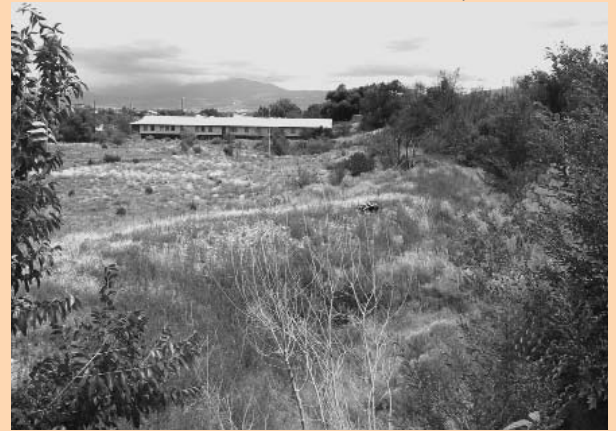
Mounds and ridges at the site are associated with buried pueblo roomblocks. To the rear is a relocated building that once was part of a World War II, Japanese internment camp.

reviewed by the Cultural Properties Review Committee at its October 5 meeting. A draft of the nomination stated that despite modern and historic use of the land, archaeological monitoring and excavations indicates much of the pueblo is intact and that the site holds the potential of revealing much about the first settlements along the Santa Fe River.