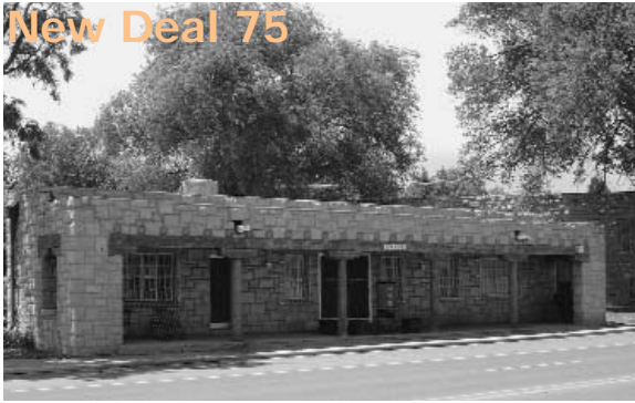
Part of the complex of three buildings built on a triangular lot in Las Vegas that made up the municipal office complex.

local New Deal resources and achievements to commemorate. Visit our new web pages devoted to the 75 th anniversary. Heritage Preservation Month in May will be dedicated to the anniversary, HPD looks to award grants for New Deal preservation projects and our State Register program will work with counties where New Deal resources have not been nominated so that more than 100 related resources will be listed in the State Register by the end of 2008.