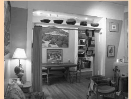
The living and dining rooms of the Risque house

Geisler's production makes the case that Silver City, at 6,000 feet, and straddling the Continental Divide in dry, southwestern New Mexico, is an "oasis of green" as much for its springs and nearby rivers as for the practicalities of some of its vernacular architecture. Risque used earthen construction and purposefully oriented his home for solar gain in winter. Its thick walls kept it cool during summer's heat – a very old idea used by the Native Americans and commonly practiced until just a few decades ago with the advent of cheap energy, Geisler concludes.