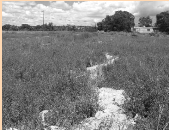
The ridge or bare ground is likely the top of a wall associated with the pueblo

Southwest recorded enough information to form a nomination to the State Register of Cultural Properties, which will be