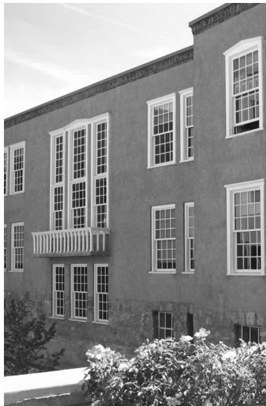
The New Deal-era Public Welfare Building was certified in 2007 at the highest level of energy efficiency of any rehabilitated historic building in the nation.